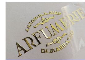
Hot Gold Foil Sticker