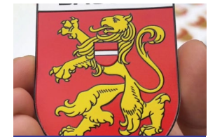
Silicone Transfer Sticker