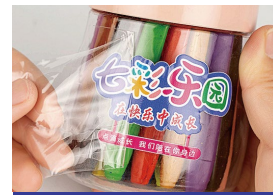
Crystal UV Transfer Sticker