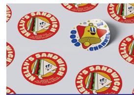
Full Color Sticker