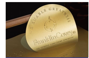
Full Gold Foil Sticker