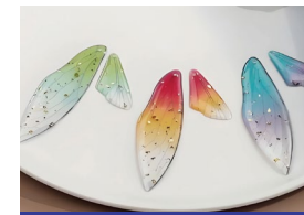
Color Epoxy Dome Sticker