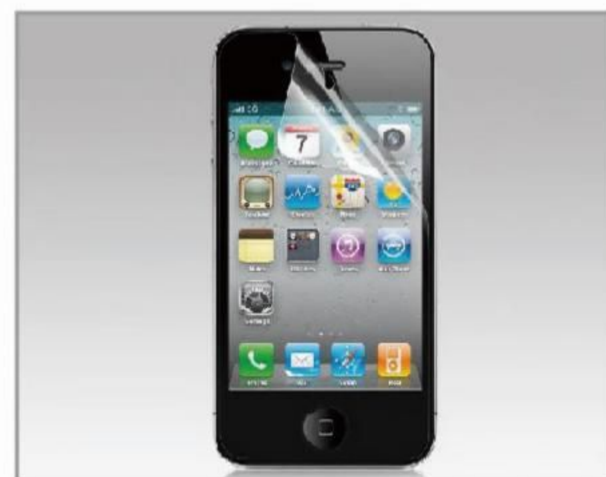
Electronic die cutting

Automatically detect and design the cutting route instead of manual operation, which is time-saving and avoid media waste because of sending wrong data. Automatically detect the direction of media feeding and accordingly adjust the cutting route to avoid wrong cutting when media is loaded differently.