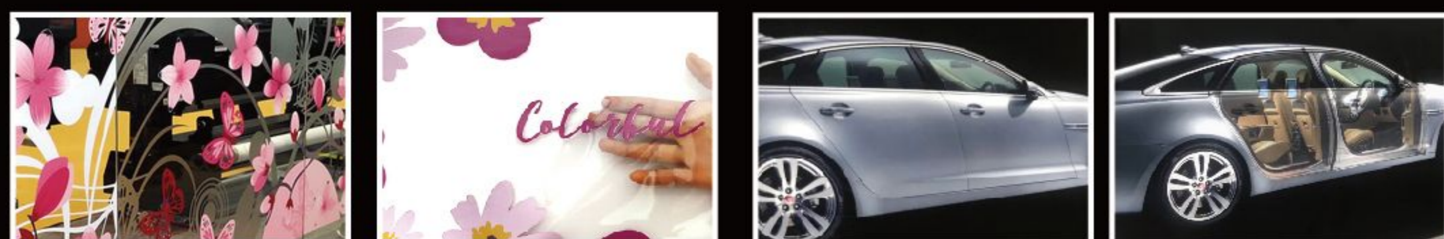
Transparent glass sticker decoration

Unique 'Color+White+Color' printing mode realizes lighting and non-lighting, consistency of color performance, instead of double-sided printing, which is suitable for various profile light box applications.