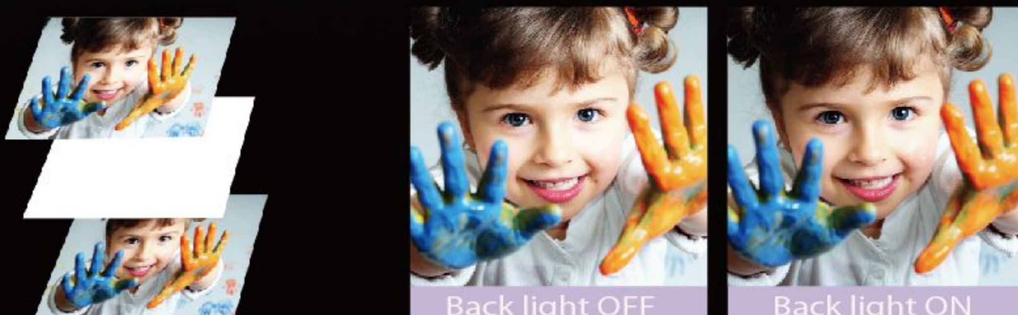
Back light OFF

The color layer that emerges when lighted