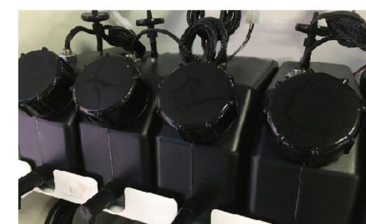
1.5L large capacity ink supply system