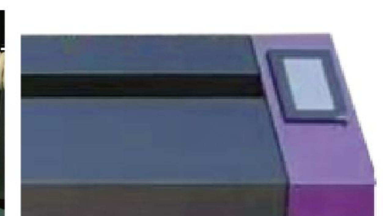
Touch screen, easy to operate