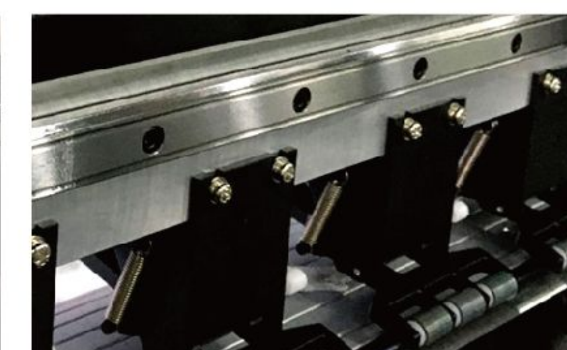
High quality imported THK high precision guide rail